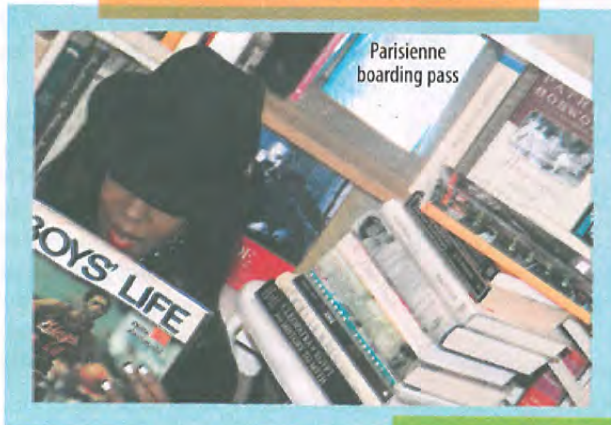
Parisienne boarding pass