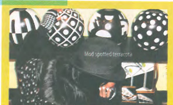
Mod spotted terracota